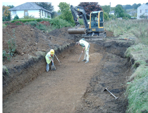
The Stanlow Dig, as mentioned several times in this edition.